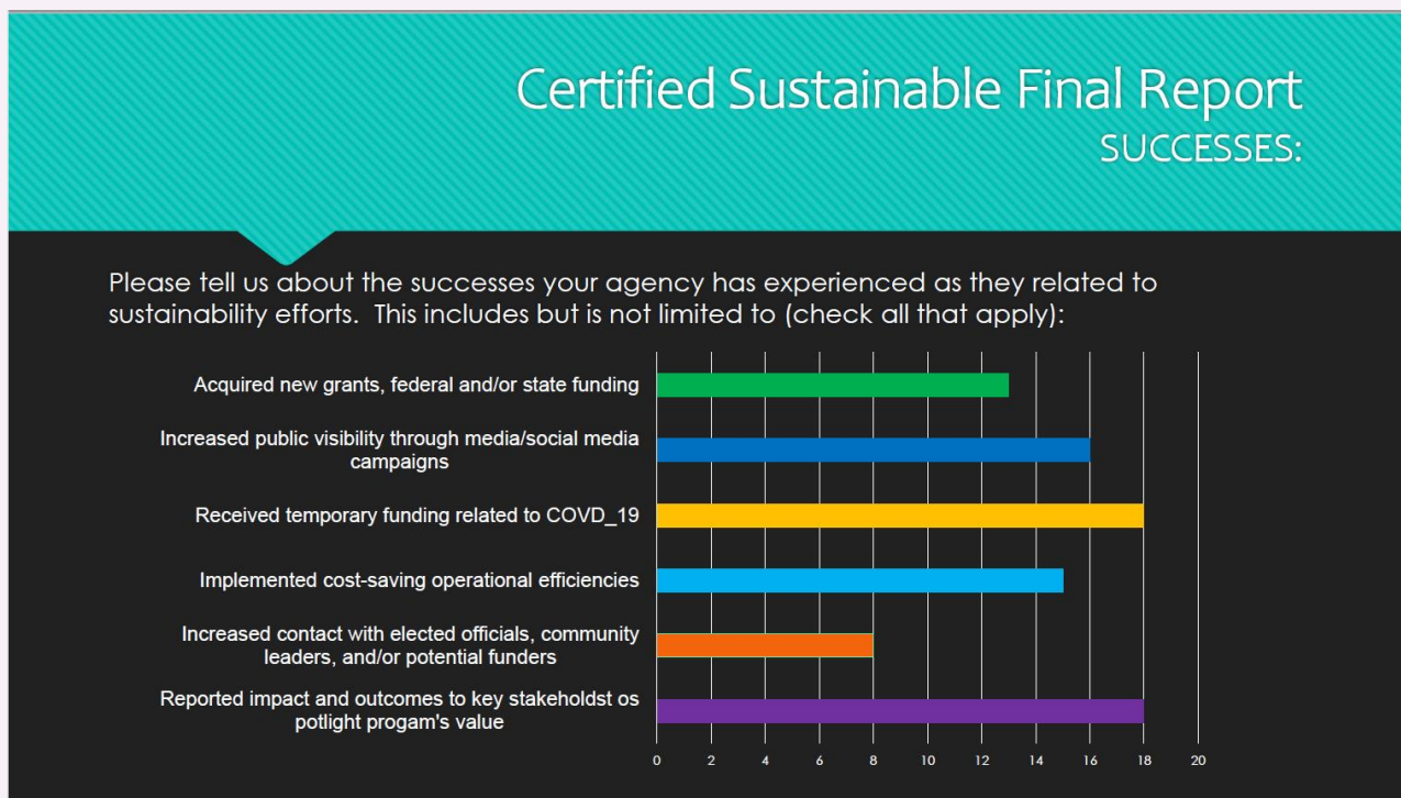
All typos are in original presentation.

A follow-up report was conducted at the end of the three-year funding period in 2020 to honor and evaluate each agency’s efforts toward sustainability. The report asked agencies to describe successes and challenges, revisit the Five-Year Budget and progress toward meeting targeted sustainability goals, and follow-up on capacity-building activities focusing on their prioritized domains. As seen on the figure below, 13 of 20 respondents said they acquired funding.